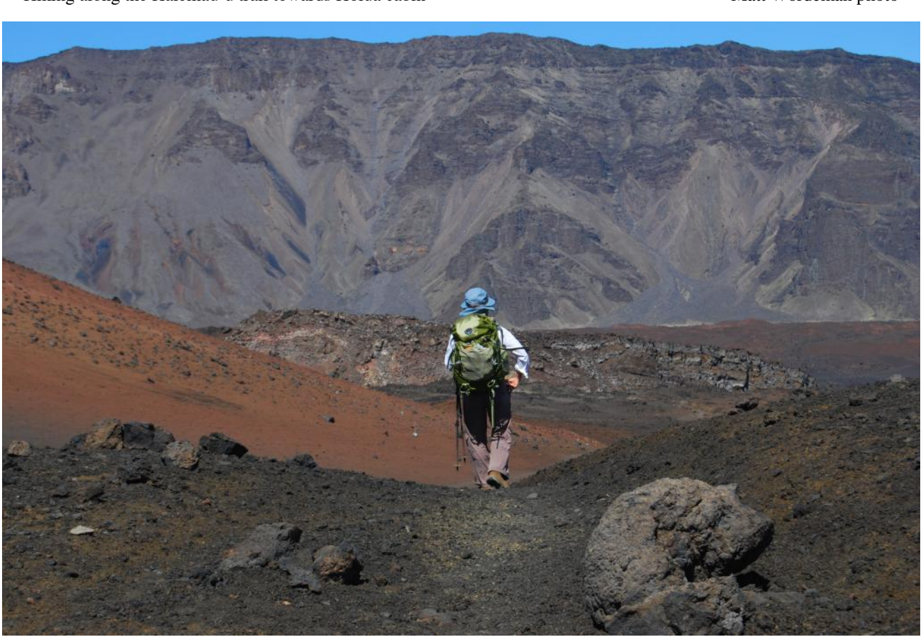
Hiking along the Halemau'u trail towards Hōlua cabin