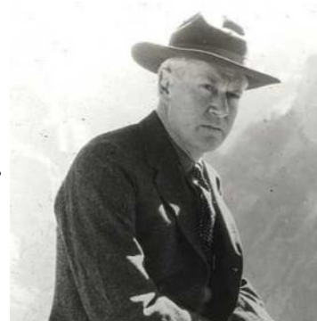
Stephen T. Mather