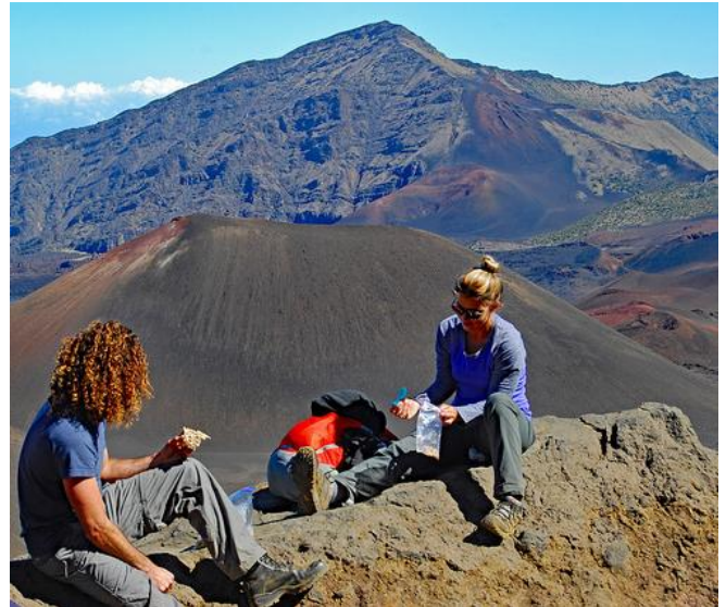
Service trip volunteers enjoy lunch at one of the world's most scenic spots.

At right is the service trip schedule for 2017. It is subject to change. The last date listed for each trip is the return date.