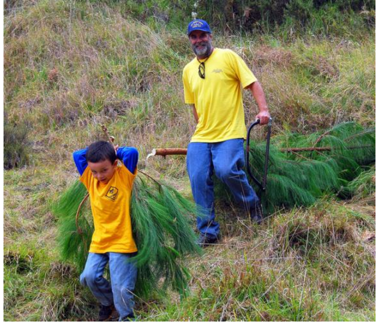
A determined young Scout hauls his Christmas tree down the hill after a day of removing invasive pines.

The event organizers hope that the requirement to pre-register will insure that the popular event goes smoothly, with enough tools, supervision and parking for all participants. Thanks to the early registrants for helping in the campaign to protect endangered species by ridding the area around the park of these invasive pines.